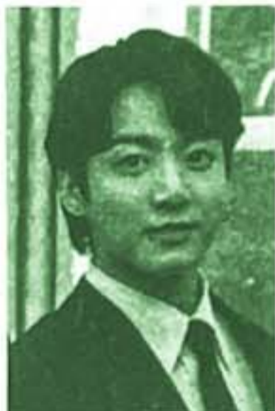
a. Jung Kook