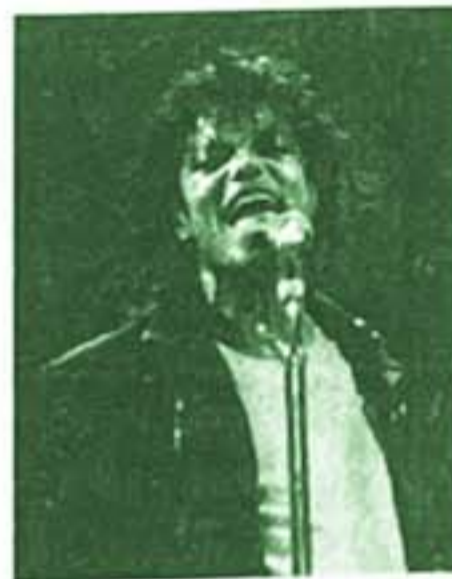
b. Michael Jackson