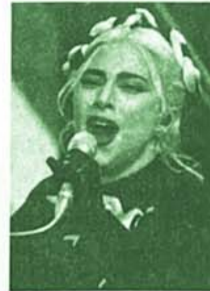
c. Lady Gaga