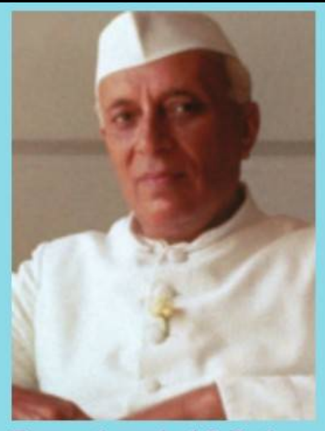
Jawaharlal Nehru India