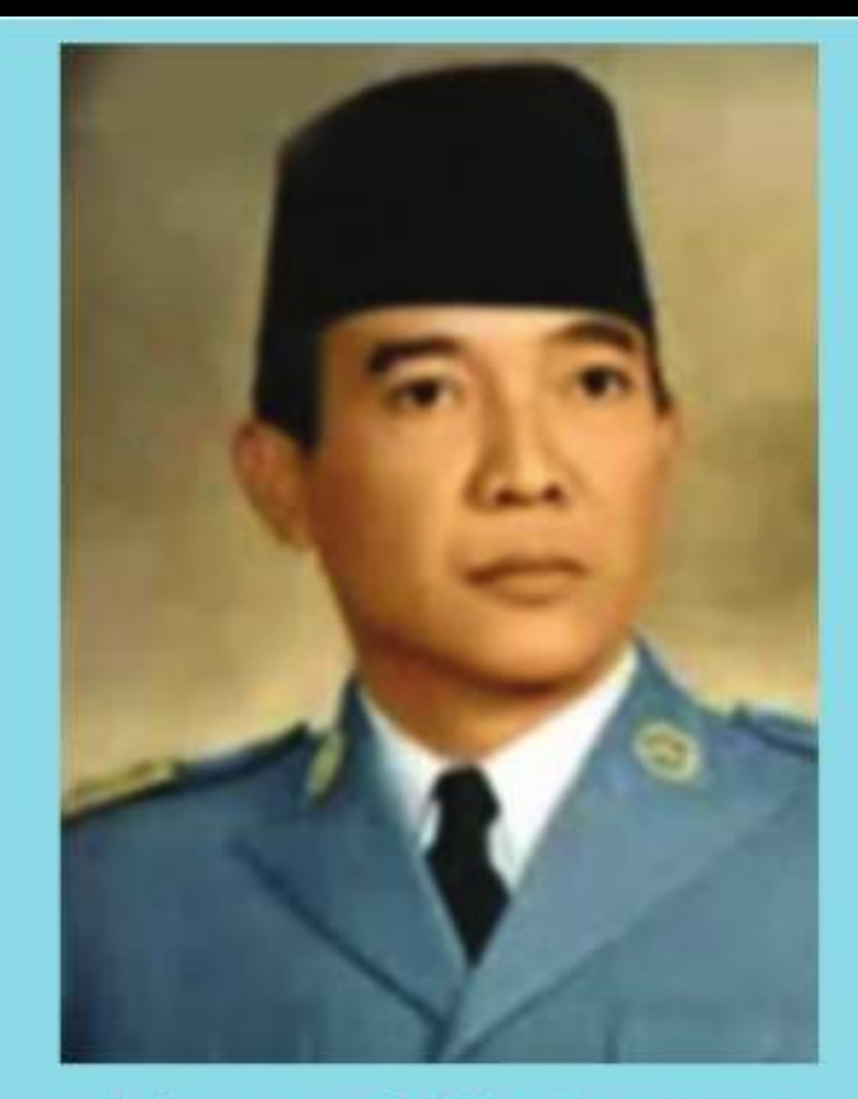
Ahmed Sukarno Indonesia