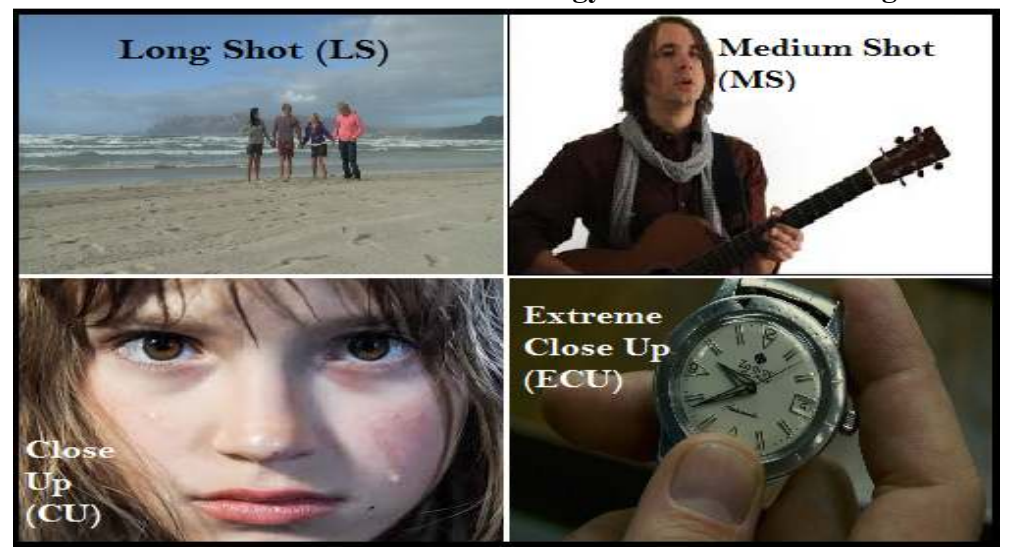
Film Terminology - Shots and Framing

(Activity 2, textbook page 61) Affixation