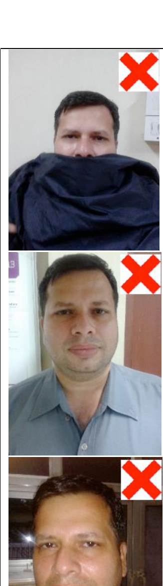
Cloth Covering facial features