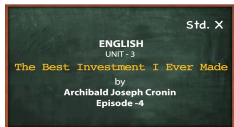
image to watch the video. After watching the video try the following assignments. Hope the following explanations will help you to have a feedback of today's class. The class dealt with paragraphs 10, 11, 12 and 13 of the anecdote 'The Best Investment I Ever Made by A. J. Cronin. Completion of a conversation and a narrative were the assignments.

Dear students, Did you watch the English class today? (10/11//2020). If not, Click on the