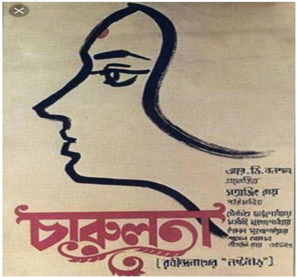
Ray's poster design