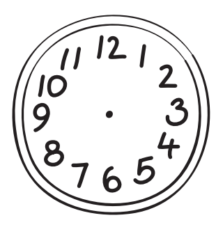
Return from school