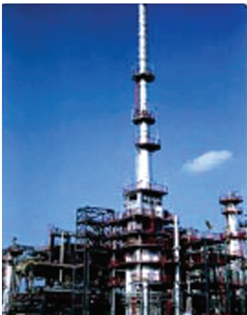
Fig. 5.5: A petroleum refinery

separating the various constituents/fractions of petroleum is known as refining. It is carried out in a petroleum refinery (Fig. 5.5).