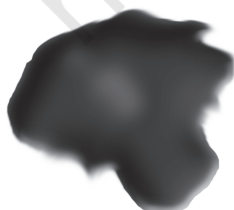
Fig. 5.3: Coal tar

It is a black, thick liquid (Fig. 5.3) with an unpleasant smell. It is a mixture of