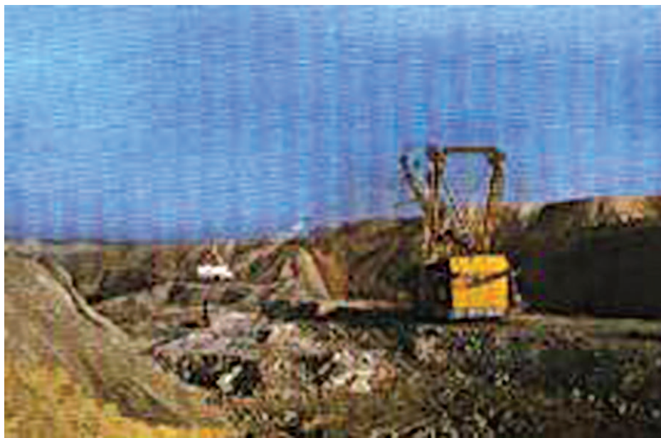
Fig. 5.2: A coal mine

When heated in air, coal burns and produces mainly carbon dioxide gas.