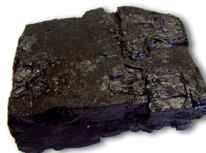
Fig. 5.1: Coal

You may have seen coal or heard about it (Fig. 5.1). It is as hard as stone and is black in colour.