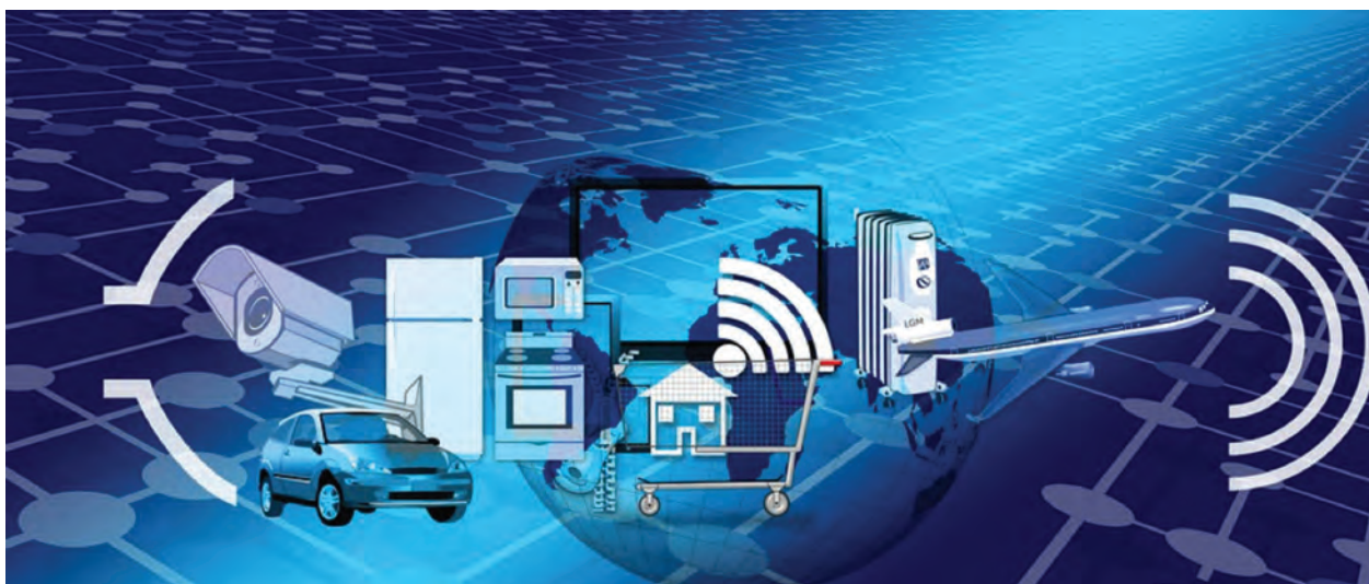
Figure 1.2: ICT around us

digital television. In addition to printed newspapers now we also have their electronic versions. Along with traditional radio, we also have online radio.