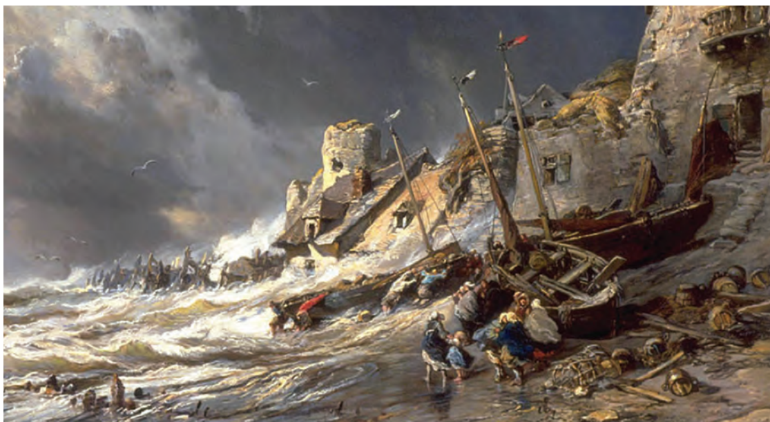
Figure 1.1: Coast Scene

Technology refers to methods, systems and devices, which are a result of scientific knowledge, being used for practical purposes. For example, Muskan went to an excursion to Bhubaneswar and visited the State Museum. She saw various mineral ores in the mineral section of the museum. She decided to capture photographs to share with others who may not have seen the ores. She borrowed her teacher's mobile and clicked pictures of the rare collection. She shared all the pictures on her blog along with a description of the ores. Many viewers commented and appreciated Muskan for sharing those pictures and description.