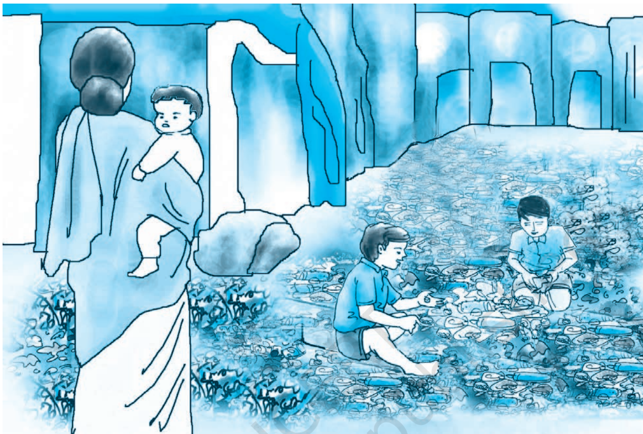
Fig. 10.3 : Children playing with waste material

Through this activity you will be surprised to find that many of the items that have been discarded by you, still have utility. On the other hand, there are certain wastes, such as wet waste (kitchen waste), which can be reduced to almost 'zero waste'. Let us now discuss how we can reduce the volume of solid waste and garbage, by practising waste management and segregation through the principles of "reuse, recycle, reduce and refuse."