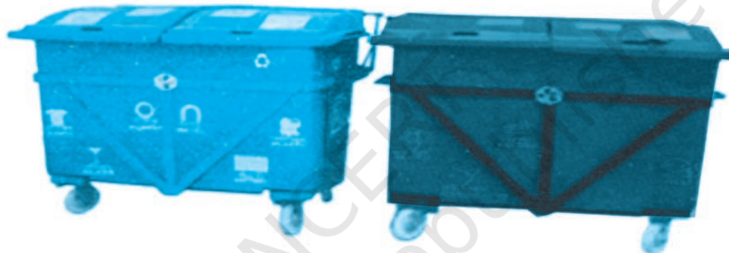
Fig. 10.4 : Blue and Green Bins

In the cities we find these bins in some places, where people can dispose of biodegradable and non-biodegradable garbage separately. Where do you think we should dispose of hazardous waste? Should there be a separate bin for it? Why?