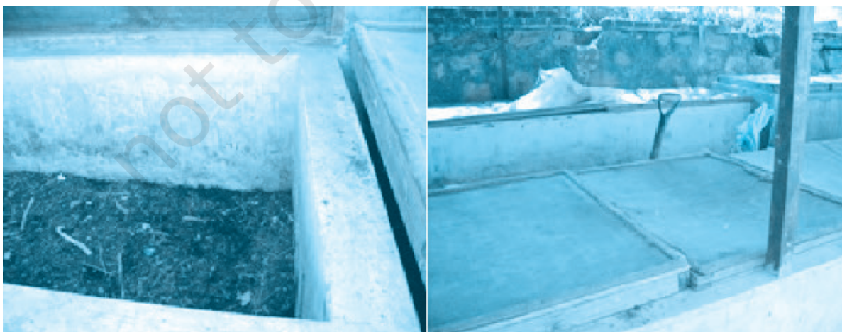
Fig. 10.5 Compost Pit prepared by Bethany Society, Shillong, Meghalaya

Often you may have come across persons (the Kabariwalas ) who visit our home, and to whom we sell old newspapers, magazines, bottles, tins, etc. Maybe, you have never thought where these products go, and what happens to them. These products are utilised as raw materials for manufacturing other products. In other words, these products are recycled . This is actually an important effort, as in this process, we not only reduce the load of garbage, but also conserve natural resources. Some of the common items that can be recycled are