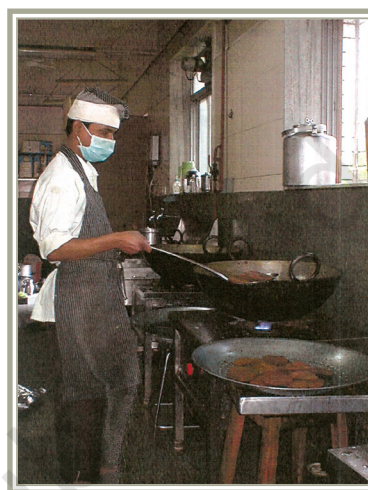
Food Production in a School Canteen

Examples of establishments that undertake food service and sales are given in Table 4.1.