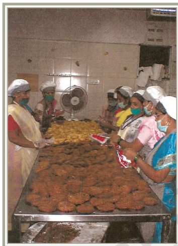
Quantity Food Preparation by a Women's group

consumers as well as are source of employment. Also, these services have tremendous economic significance to the country. Hotels and catering services support the tourist, travel and holiday industries. It is a major earner of foreign exchange since this industry brings money into the country in exchange for its services. Through the tourism industry, hoteliers and caterers indirectly contribute to advancing understanding between different countries.